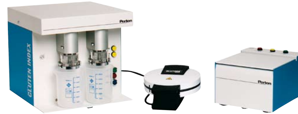
Dual Glutomatic 2200 instrument, Glutork 2020 and Gluten Index Centrifuge 2015.