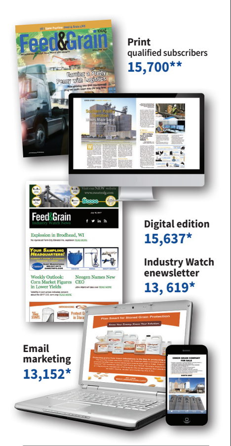
*Publisher's own data/**June 2017 BPA audit statement

Year-in, year-out, your challenge is constant: Optimize the value of your financial resources. When it comes to marketing communications, Feed & Grain is your partner in optimizing the value of every hard-earned dollar you invest.