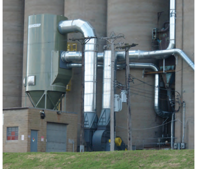
MODEL 12SWF504 ON GRAIN DUST GRAIN INDUSTRY