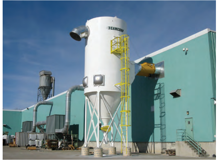
MODEL 10SWF504 ON PAPER DUST PAPER PRODUCTS INDUSTRY