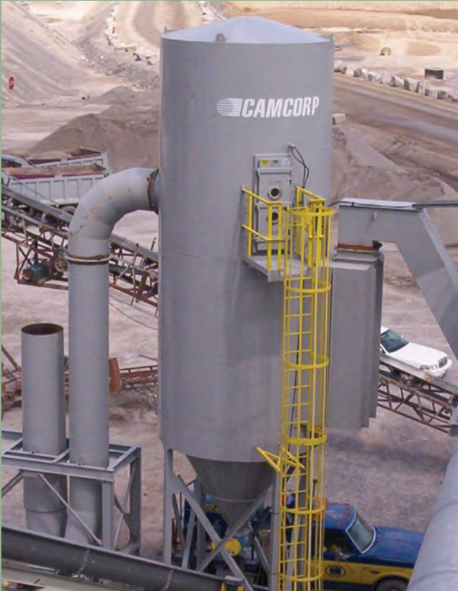
MODEL 8SWF256 ON LIMESTONE DUST AGGREGATE INDUSTRY