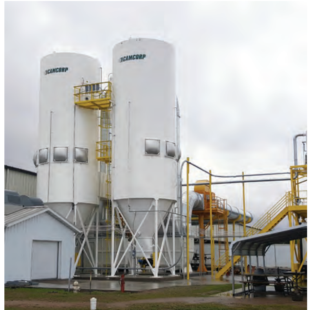
(2) MODEL 12SWF504 ON WOOD DUST FURNITURE INDUSTRY