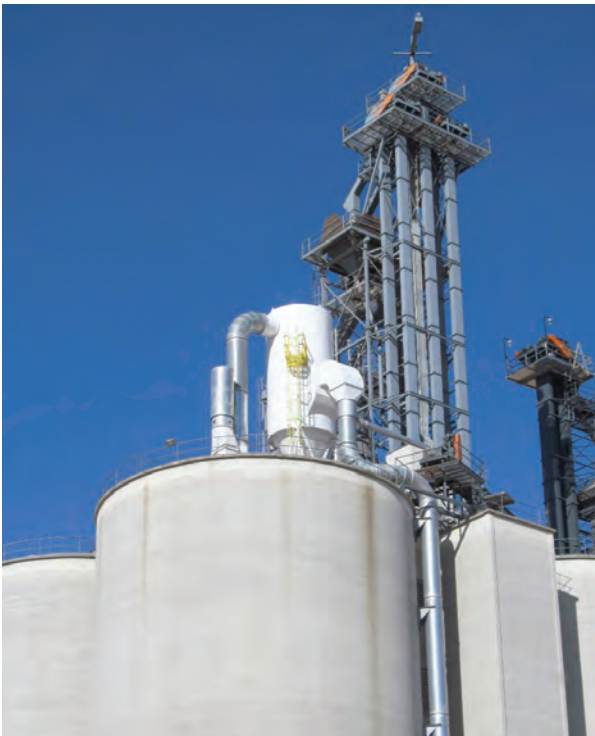
MODEL 10HVP368 ON GRAIN DUST GRAIN INDUSTRY