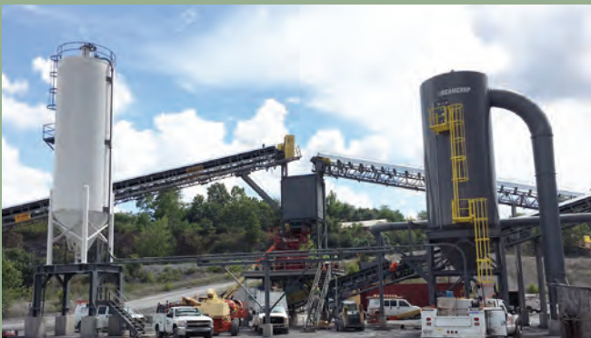
MODEL 12SWF504 ON LIMESTONE DUST AGGREGATE INDUSTRY