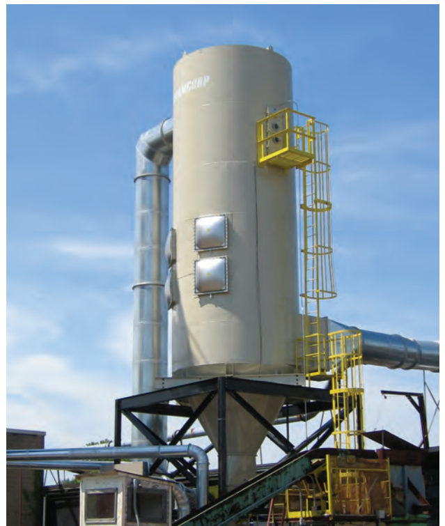
MODEL 12HVP368 ON WOOD DUST LUMBER INDUSTRY