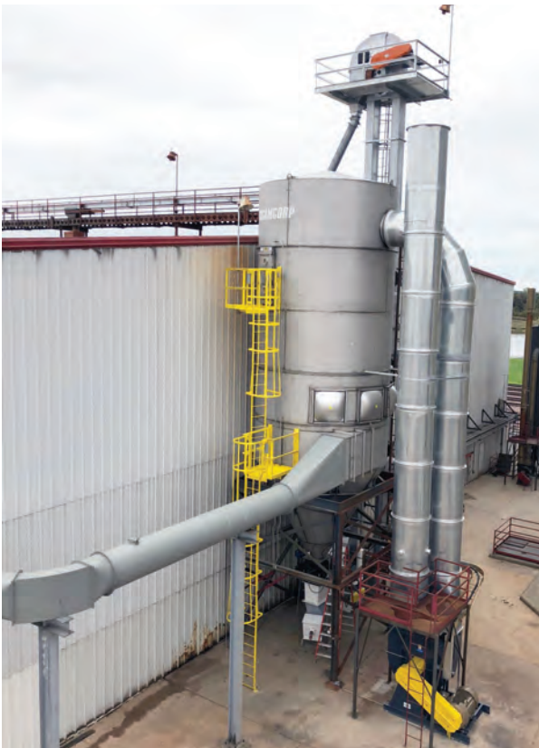
MODEL 10HVP504 STAINLESS STEEL ON DDGS ETHANOL INDUSTRY