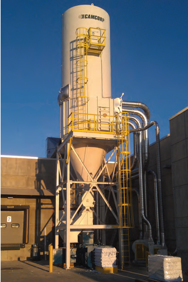
MODEL 10SWFP292 ON PAPER TRIM PRINTING INDUSTRY