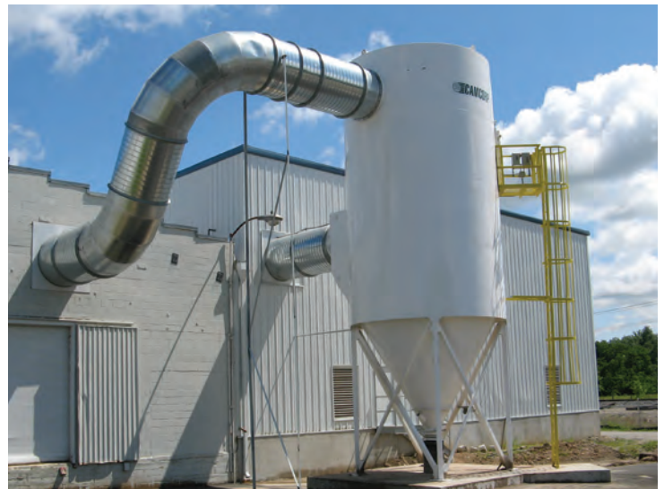
MODEL 10SWF504 ON PAPER DUST PACKAGING INDUSTRY