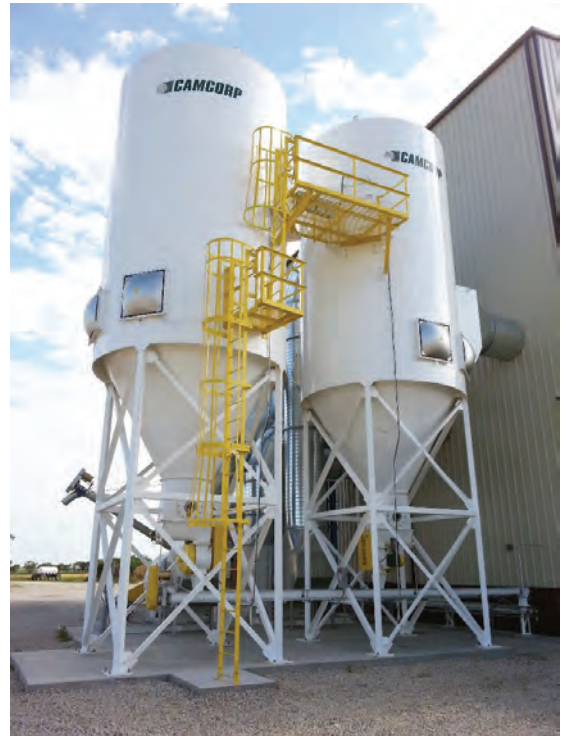
(2) MODEL 10SWF504 ON SEED DUST SEED INDUSTRY