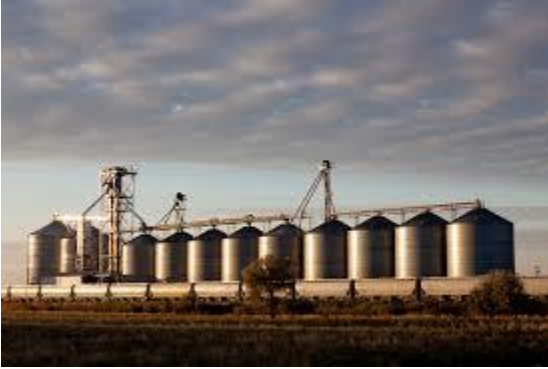
Idaho - Existing facility expansion design and operation