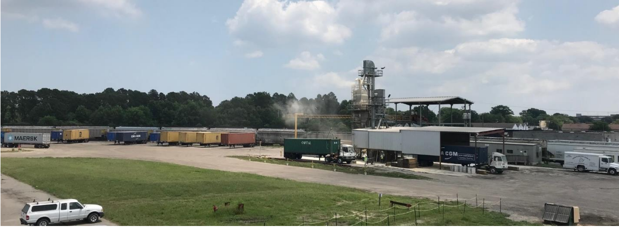
Virginia - Greenfield transload (rail/truck to container) design, build, operate, and expansion