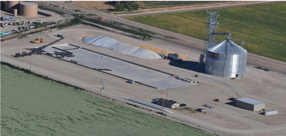
Idaho – Greenfield rail and truck facility design, build, operate, and expansion