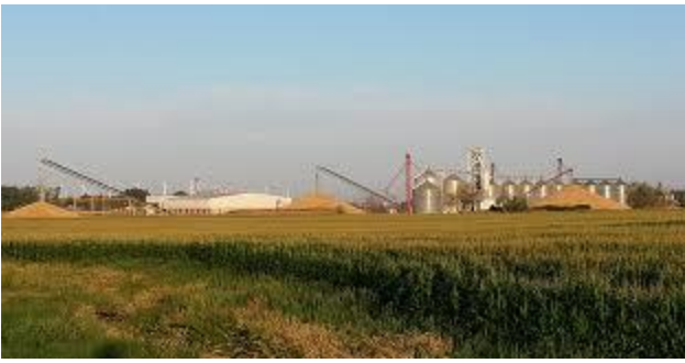
Idaho - Existing facility expansion design and operation