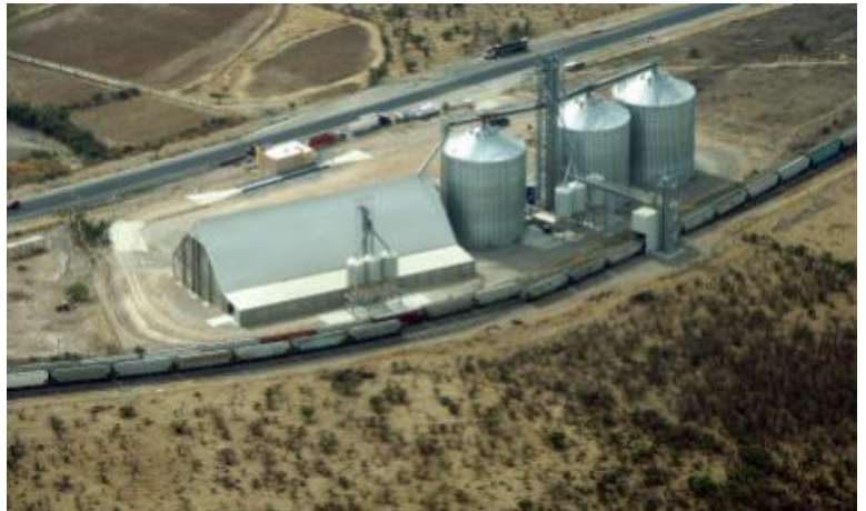
Mexico – Greenfield shuttle unload facility design, build, and operate